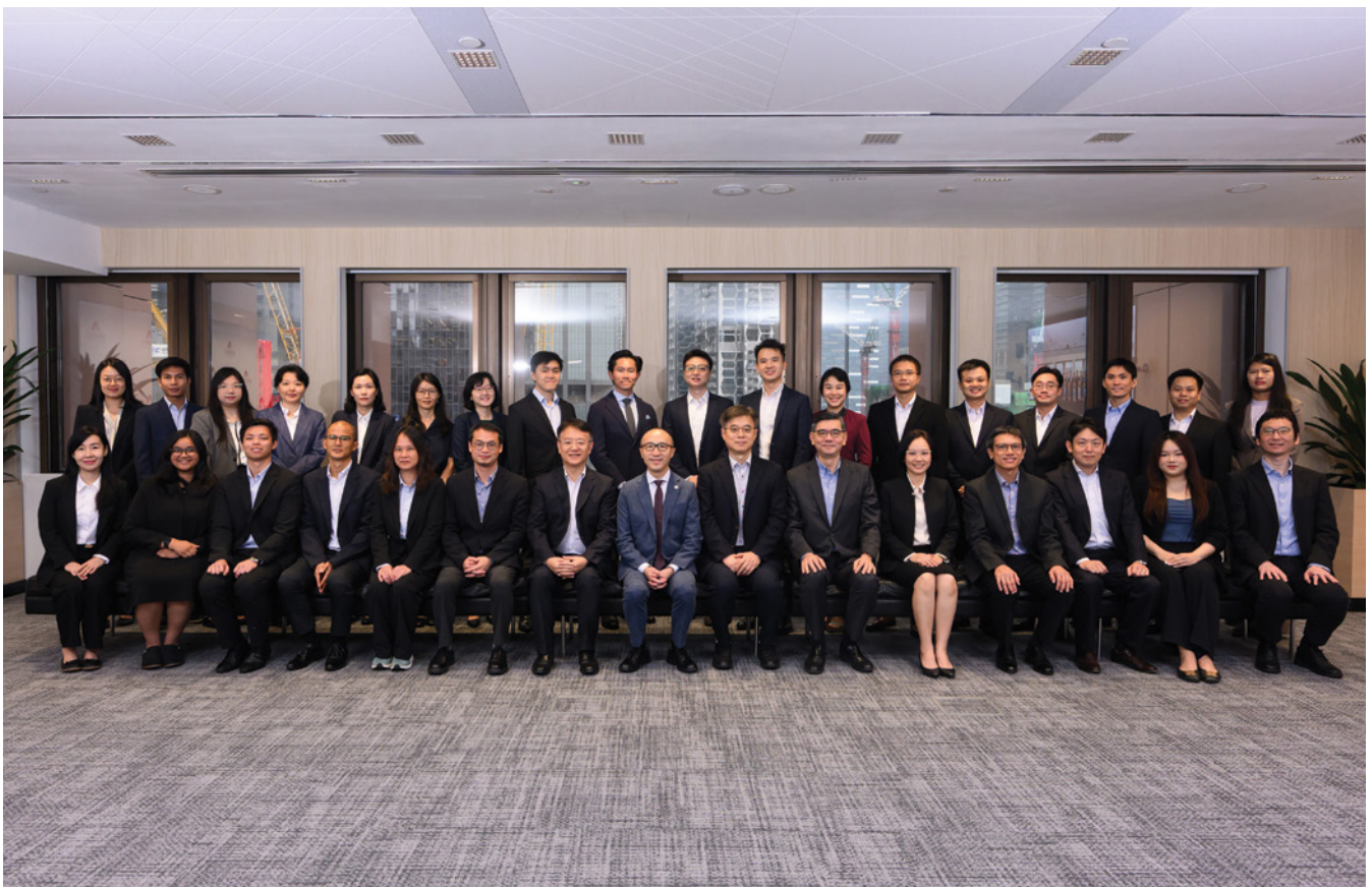
AMRO Country and Regional Surveillance Groups