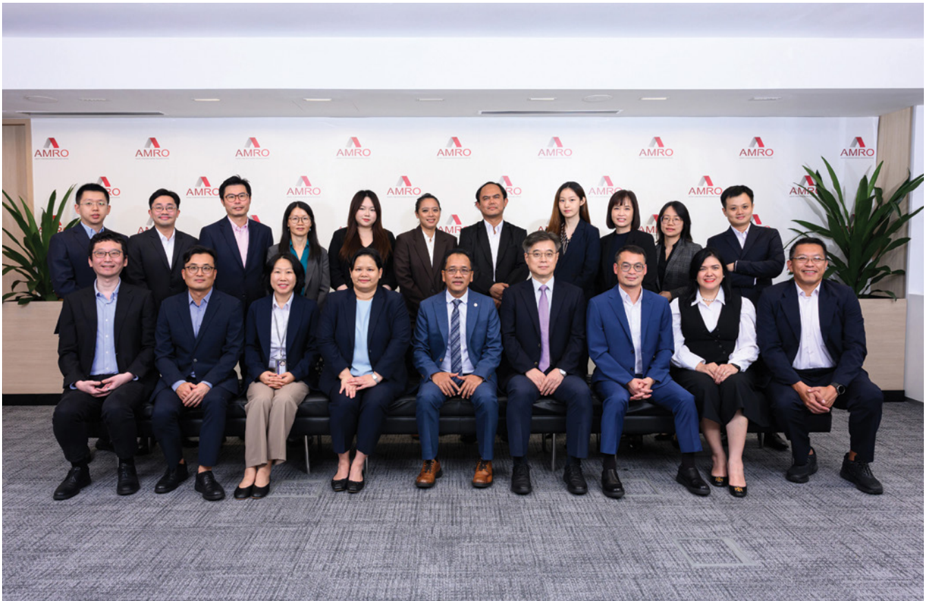
AMRO Financial Surveillance, Fiscal Surveillance, and Macro-Financial Research Groups