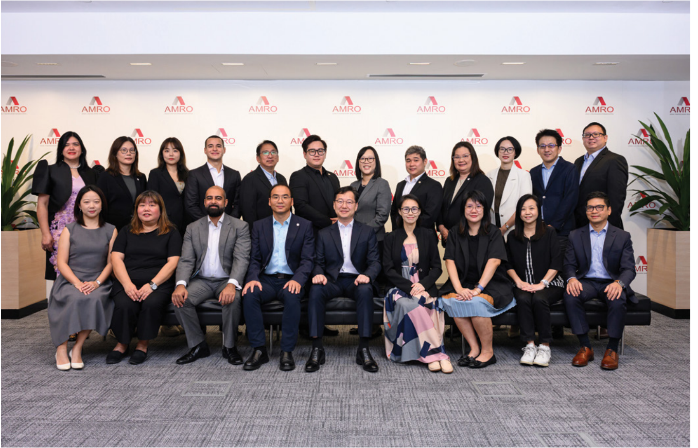
AMRO Budget, HR and Support Service Group; Legal Team; and Technical Assistance Team