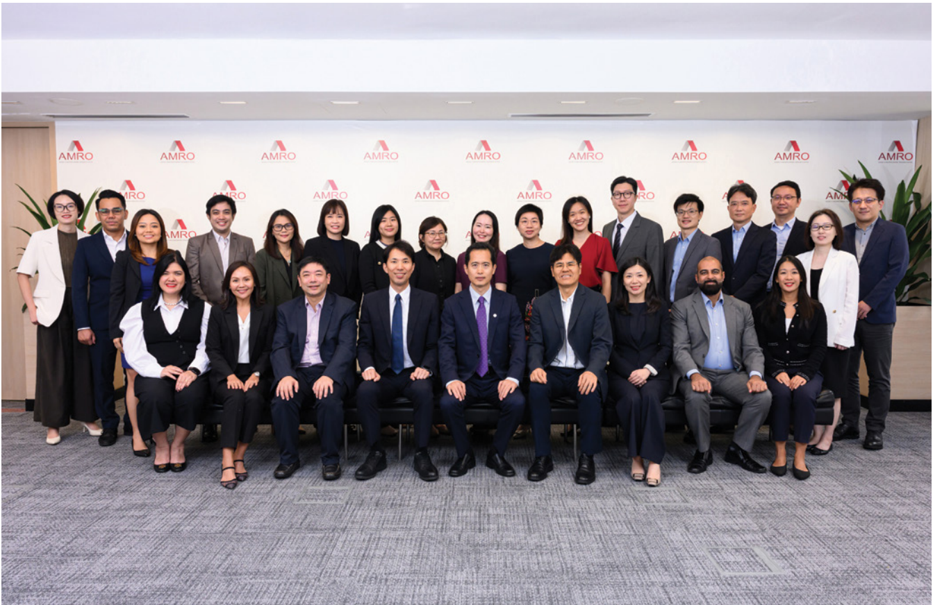
AMRO CMIM Support Group; Strategy and Coordination Group; Policy and Review Group; and Technical Assistance Team