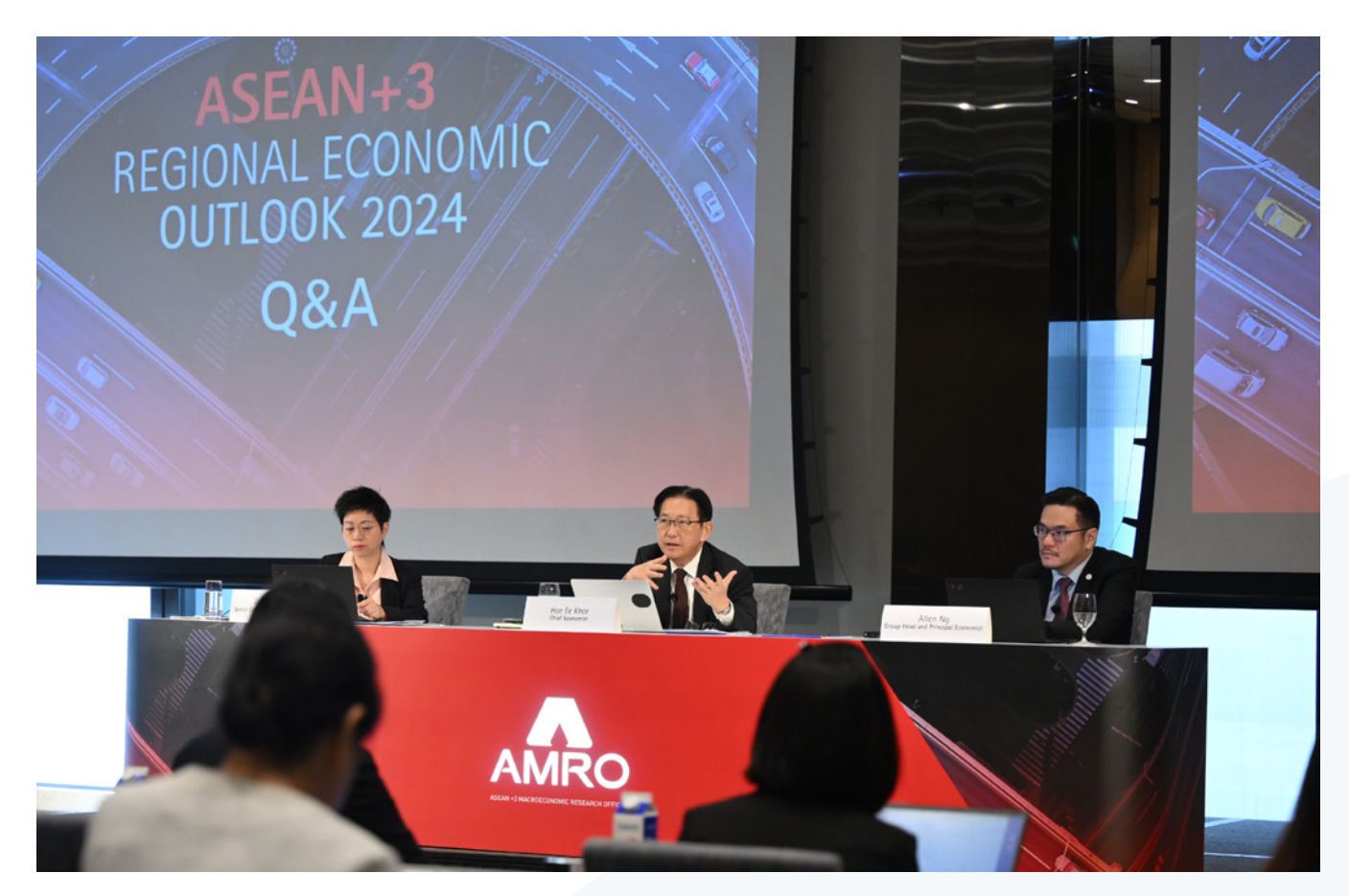
AREO 2024 press conference