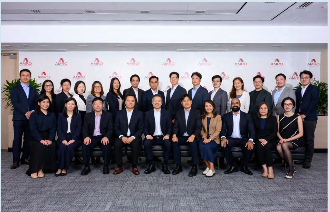
AMRO CMIM Support Group; Strategy and Coordination Group; Policy and Review Group; and Technical Assistance Team