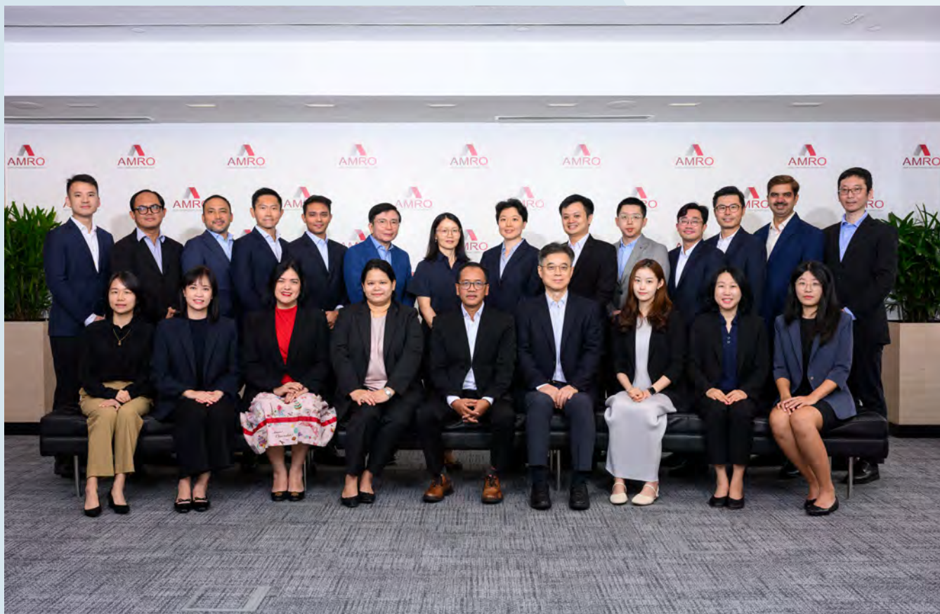
AMRO Financial Surveillance, Fiscal Surveillance, and Macro-Financial Research Groups