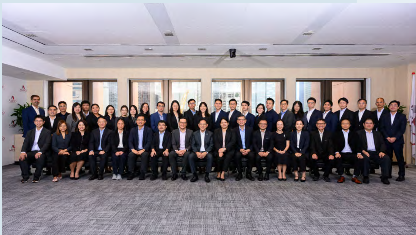
AMRO Country and Regional Surveillance Groups