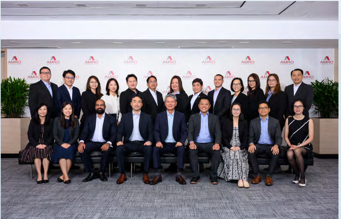
AMRO Budget, HR and Support Service Group; Legal Team; and Technical Assistance Team