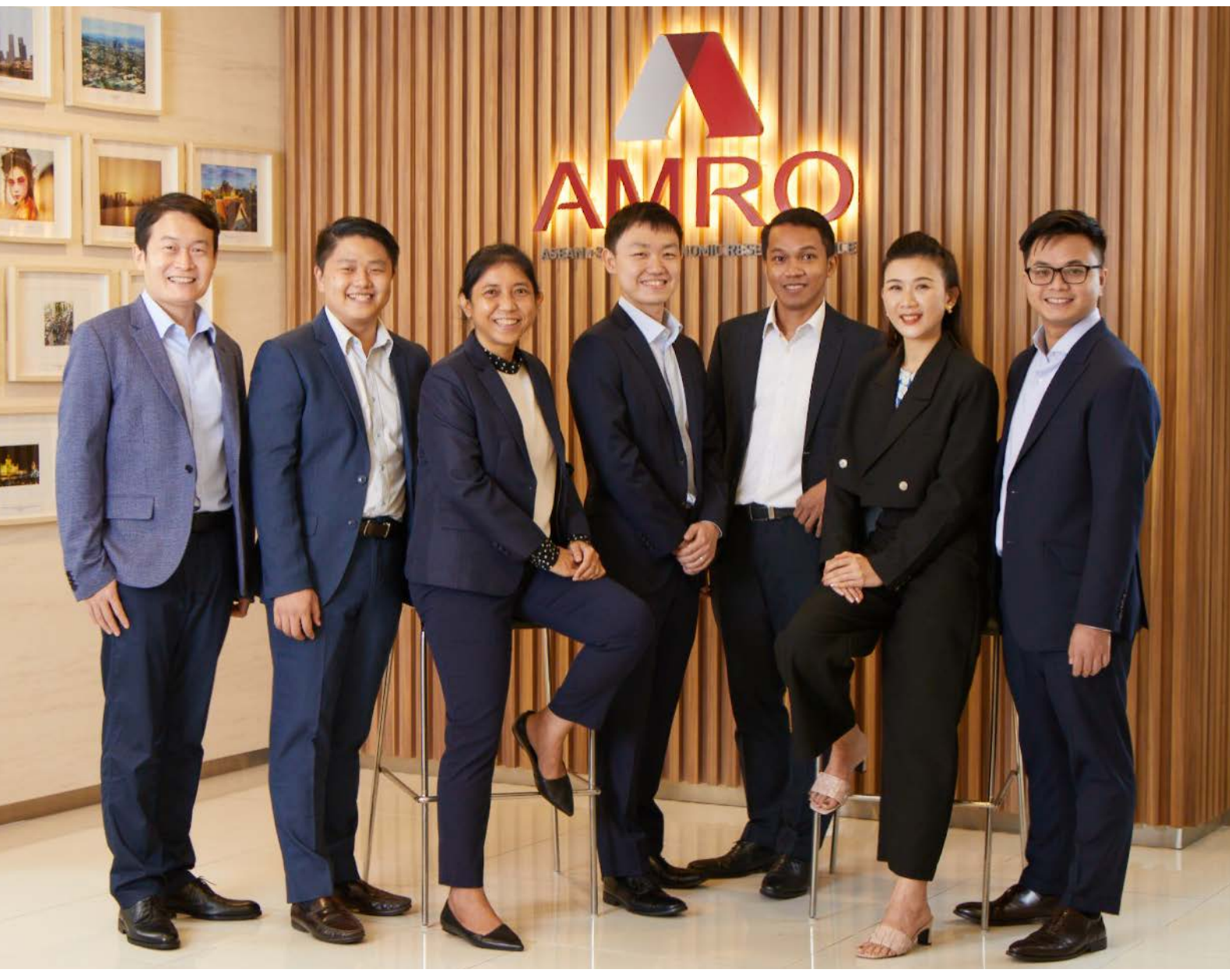
Secondees from Cambodia, Japan, Korea, Lao PDR, and Vietnam join AMRO in 2021.

Secondees have enhanced AMRO's research and work, for instance through their contributions to the ACVs and ACRs. They function as knowledge bridges between AMRO and member authorities by gathering country-specific economic information and data in local languages.