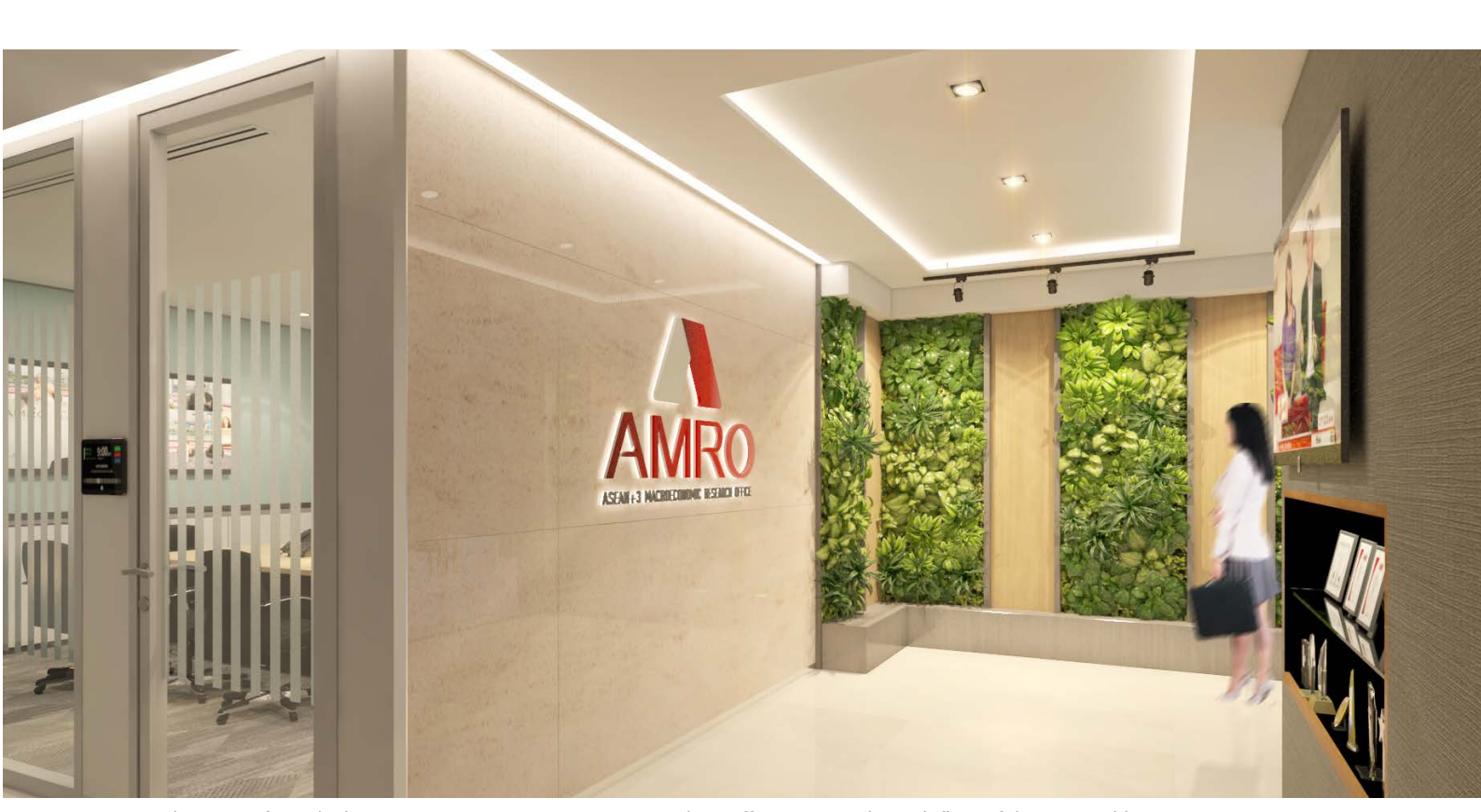
With support from the host country (Singapore), AMRO expands its office space to the 14th floor of the MAS Building.

To improve business continuity capabilities in a systematic manner, AMRO developed the Organizational Business Continuity Management System. Testing of and improvements to the system will continue in 2022.