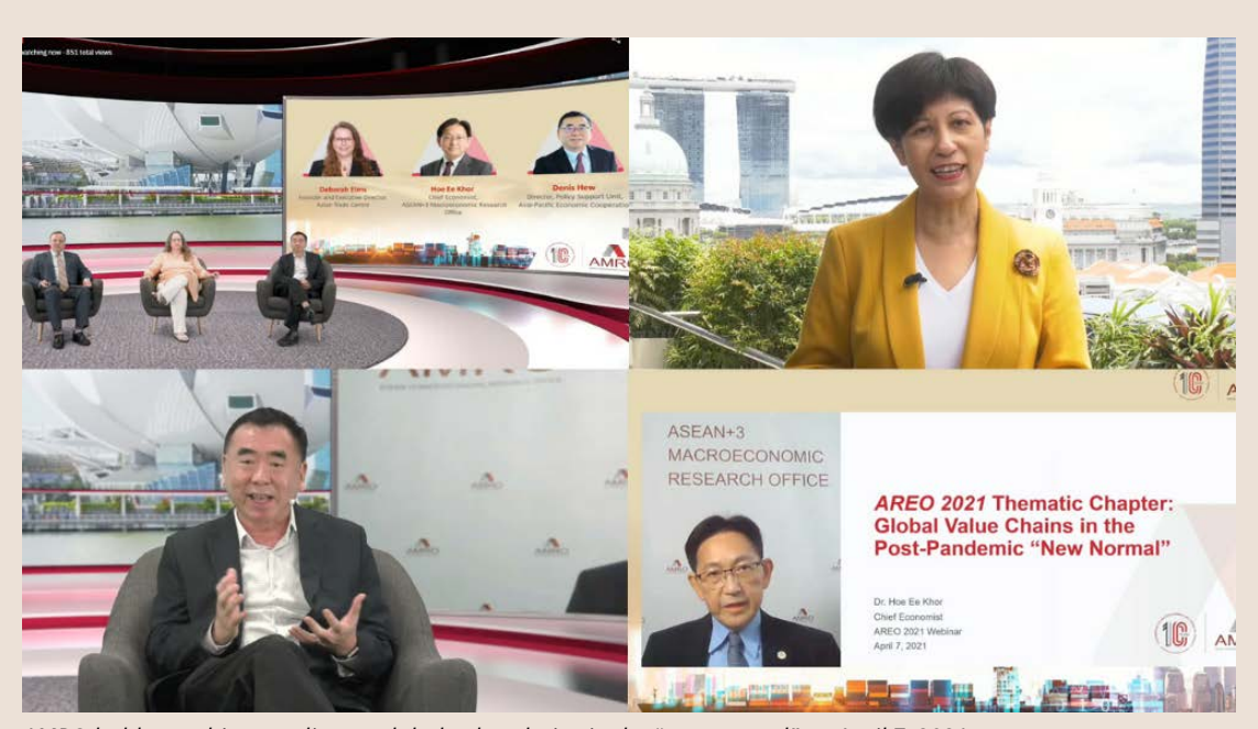
AMRO holds a webinar to discuss global value chains in the "new normal" on April 7, 2021.

These efforts have helped AMRO stay abreast of daily movements in the constantly changing financial markets, examine the challenges and opportunities facing the sector, and provided invaluable input to AMRO's surveillance work.