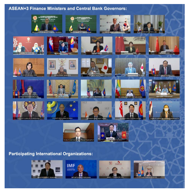
AMRO attends the virtual 24th ASEAN+3 Finance Ministers' and Central Bank Governors' meeting on May 3, 2021.

In Q2 2021, Senior Management approved AMRO's Corporate Crisis Communications Plan. In Q3 2021, AMRO organized media training for 29 employees, including Senior Management, Group Heads, and Economists, to enhance their knowledge on how best to convey the organization's messages.