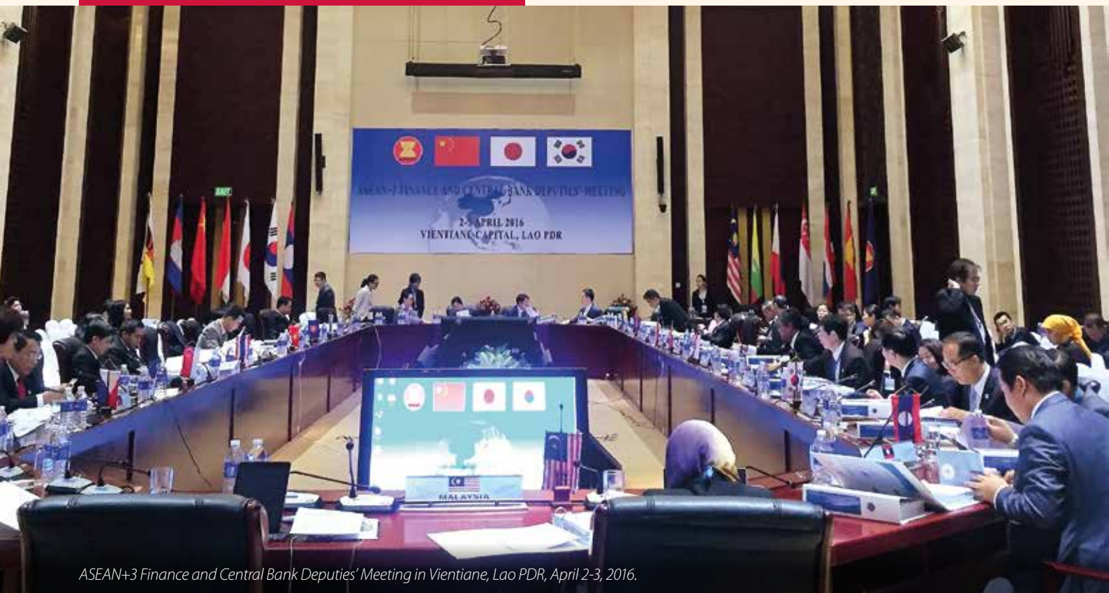
ASEAN+3 Finance and Central Bank Deputies' Meeting in Vientiane, Lao PDR, April 2-3, 2016.

In 2016, AMRO supported members in conducting a test run on the CMIM-IMF linked portion of the CMIM in collaboration with the IMF. AMRO also contributed to upgrading the CMIM OG to provide clarity for the establishment and activation procedures of the CMIM arrangements as well as proposed a more comprehensive ERPD Matrix framework for assessing a member's eligibility to access the CMIM-PL.