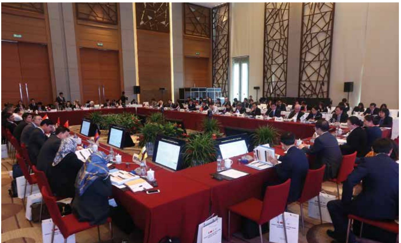
The comprehensive ERPD Matrix framework was endorsed by the Deputies at the AFCDM+3 in Guiyang, China, in December 2016.

The test run in 2016 marked a milestone in advancing cooperation between the CMIM and the IMF, which is not only important for the CMIM given the IMF linked portion facilities, but also in line with the global initiative to strengthen the GFSN through enhanced cooperation between the CMIM and the IMF.