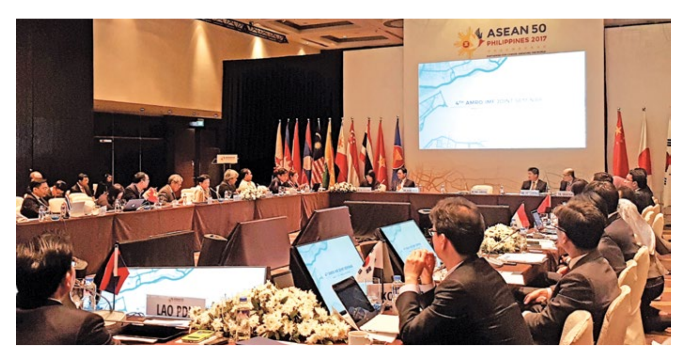
The 4<sup>th</sup> AMRO-IMF Joint Seminar taking place in March 2017 in Manila, the Philippines.

financial stability through advancing cooperation and leveraging on each other's expertise. It also institutionalizes the exchange of views on common members' economies, training and staff exchange opportunities for staff, capacity building for ASEAN+3 members in macro-economic management, and joint activities that will contribute to strengthening the global and regional financial safety nets. The AMRO-ESM MoU provides a general framework to strengthen collaboration in matters of common interest and covers the organization of joint activities, joint research, technical cooperation, capacity building and staff exchange, among others.