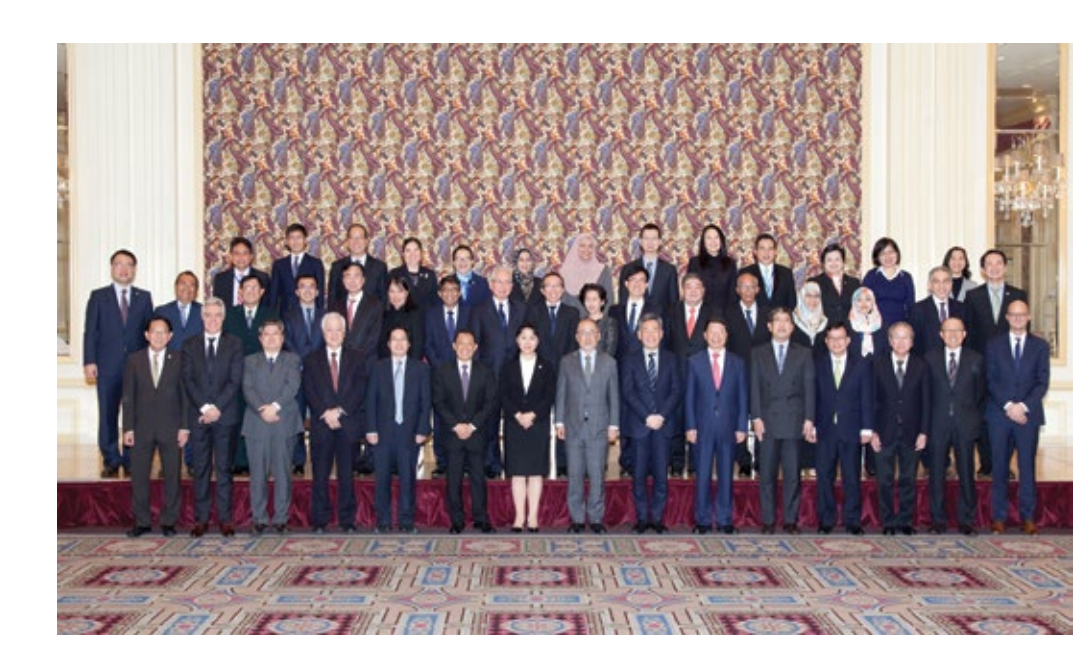
AMRO Senior Management team, ASEAN+3 Finance and Central Bank Deputies, and distinguished speakers and participants at the 2017 ATFF in December 2017 in Asahikawa, Japan.

Throughout the year, AMRO also kept up the momentum by publishing four 2016 Annual Consultation Reports (Hong Kong, China; Philippines; Singapore; and Thailand), and another four 2017 Annual Consultation Reports (Cambodia, Myanmar, Singapore and Thailand). After each Annual Consultation Visit, AMRO also issued a press release capturing key points of its preliminary assessments of the economy.