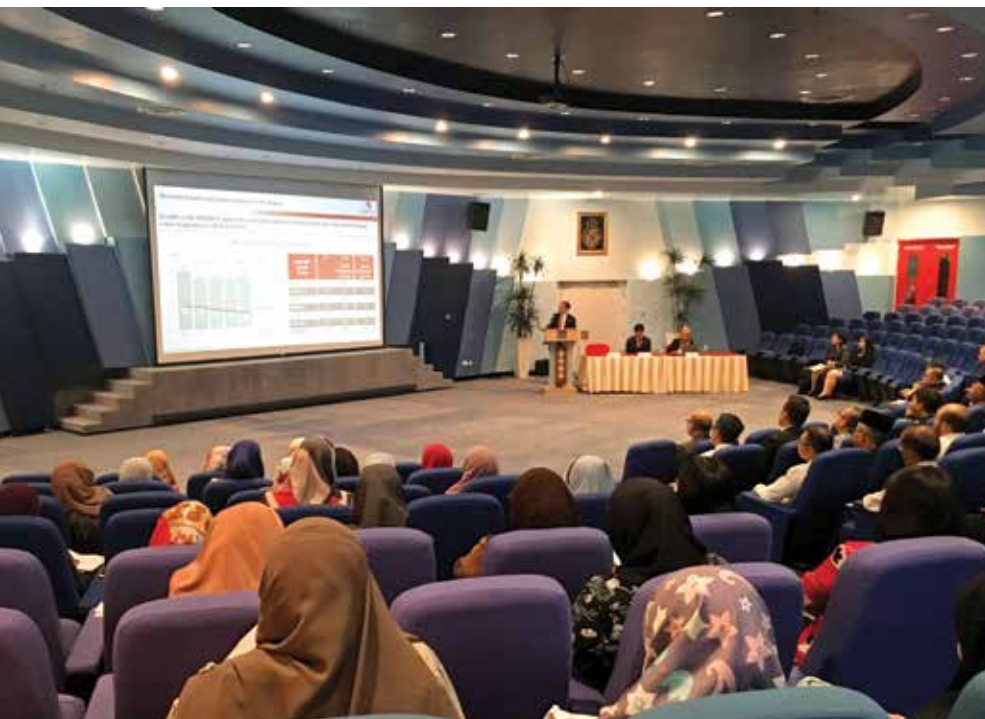
AMRO mission team conducts a lecture to present key findings of the AREO 2018 and introduce the CMIM during the Annual Consultation Visit in November 2018 in Brunei Darussalam. The lecture is well attended by professors/lecturers and students from the Universiti Brunei Darussalam and officials from the Ministry of Finance and Economy and other ministries.

Mindful of the importance of members' confidence and trust in AMRO as a trusted policy advisor, AMRO carried out impartial, transparent and timely surveillance and enhanced engagement with members in 2018. AMRO conducted formal policy dialogues with members based on its draft preliminary assessments at the closing of each annual consultation visit. While roundtable discussions with various stakeholders had strengthened AMRO's communication with industry thought leaders, the issuance of a press release at the end of each consultation visit and the publication of annual consultation reports had further improved the transparency of AMRO's work. During the year, AMRO also conducted press interviews on some member economies, elevating AMRO's visibility.