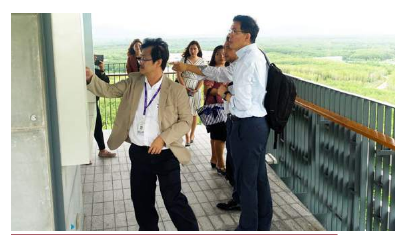
Our Thailand mission team visited the Vidyasirimedhi Institute of Science and Technology and the Eastern Economic Corridor Office to gain insights into the development of this flagship infrastructure project and its potential impact on the Thai economy.

In addition, the Surveillance Operational Manual was updated to incorporate improved guidelines, on consultation activities and engagement.